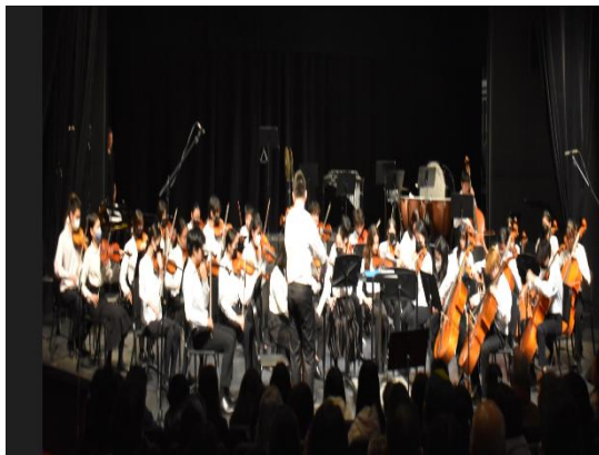
Figure 4 LB Strings in full swing entertain an excited and very full auditorium of parents, community members and staff.