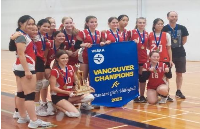
Figure 1 2022 City Champions!!!

Grade 8 Girls Volleyball Team Win the City Championships: