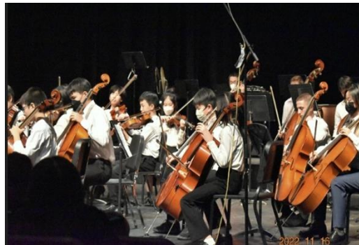
Figure 5: The LB Strings orchestra in the newly opened school auditorium.